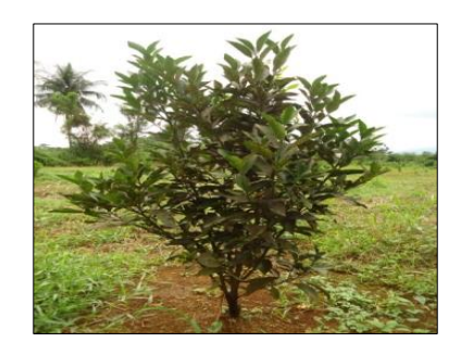
Fig. 1. Borneo prima mandarin citrus

The research was conducted in IPB research station, Bogor (230 m above sea level). The experiments were conducted on a three years old Borneo Prima Mandarin ( Citrus reticulta cv Borneo Prima) grafted on Rough lemon ( Citrus jambhiri Lush.) rootstock (Fig 1).